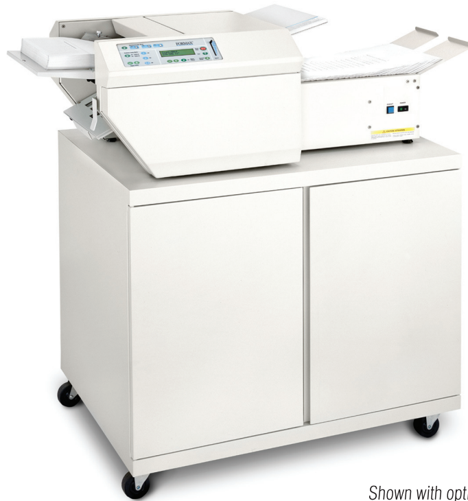
Shown with optional cabinet and 18" conveyor

LOCAL DEALER: AUTOMATED BUSINESS MACHINES, INC. 6073 NW 167th Street, Suite C-24 Miami, FL 33015-4347 www.abmmiami.com (305) 620-0020 • (954) 739-1222 (561) 833-9044 • (800) 446-5501 fax (305) 620-2201 • sales@abmmiami.com