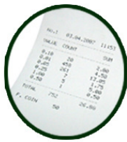
PRINT OUT RECEIPT